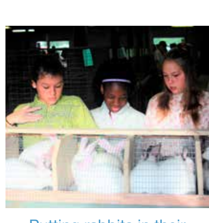
Putting rabbits in their slots ready to judge