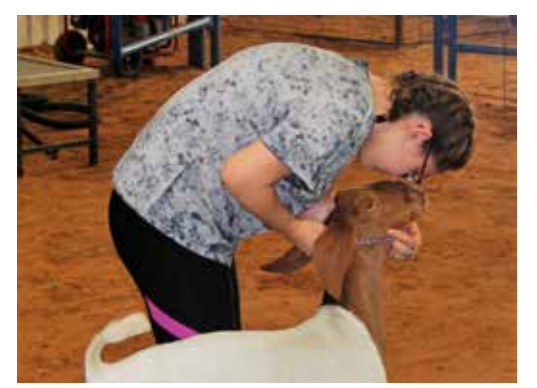
Love talk before the show