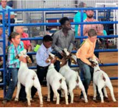
Quiet encouragement from