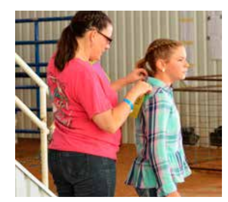
Pinning on numbers

We have positions open for House Parents in Training & Accounts payable. Health Insurance, Retirement & more benefits. Inquire at 575-356-5372 or online at executive.director@nmcch.org