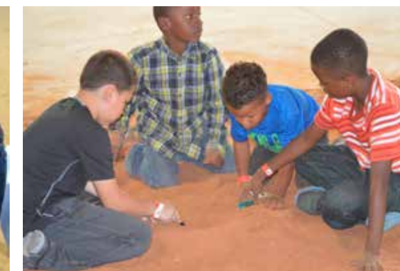
The younger boys playing cars in the dirt during the shows – Imagine that!