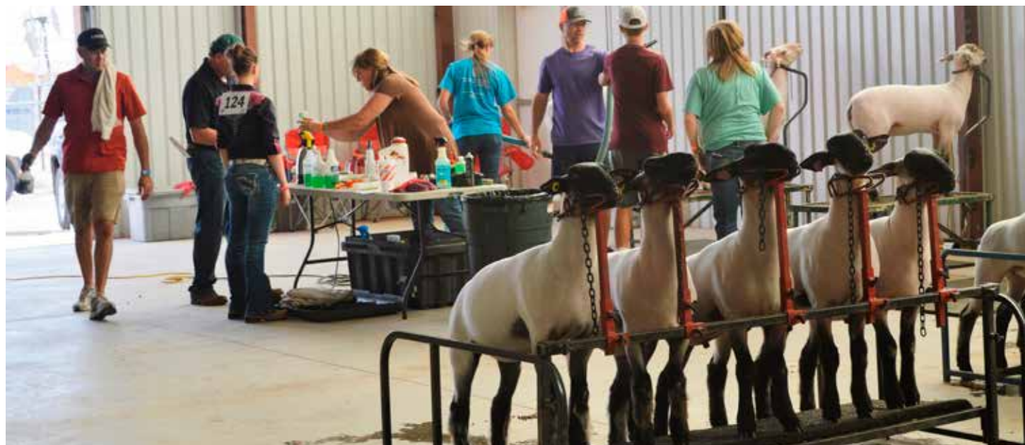
Wonderful support staff and friends show up to help lighten the load.