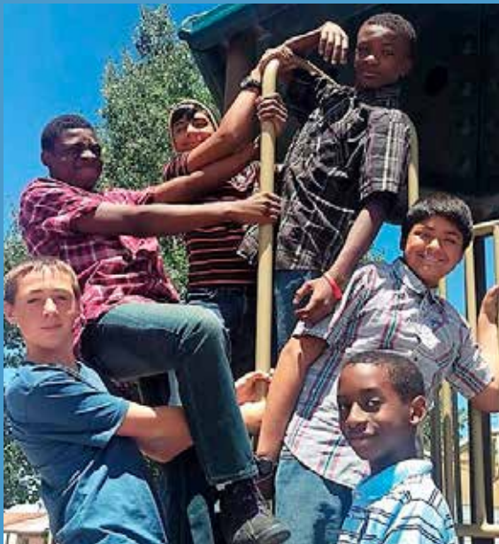
Hanging out with Friends!