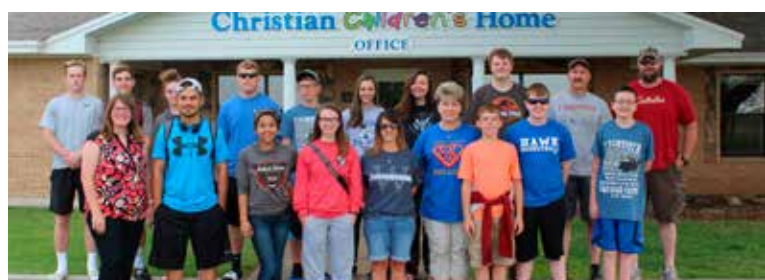
Group from Hutchison, KS