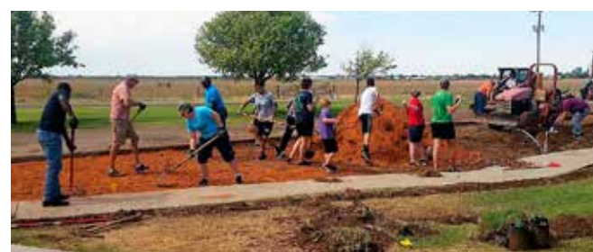
Group from Wylie, TX