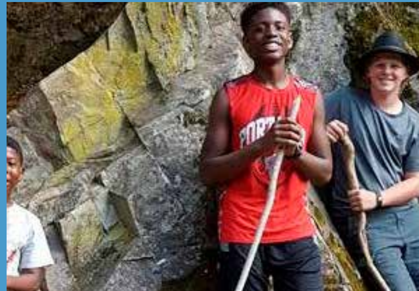
A great outdoors! The boys are always ready to go hiking in the Ruidoso Mountains.

New Mexico Christian Children's Home 1356 New Mexico 236 Portales, NM 88130-9411