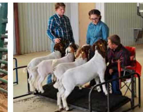
Goats washed and ready!