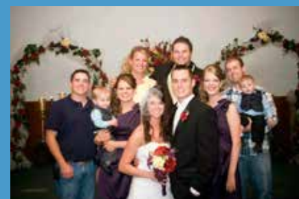
All happily married!

You too can make a difference in the lives of children and families through A Mother's Choice. You can help us provide funds to care for birth mothers during pregnancy who are considering an adoption plan. You can help "put families together", providing permanent quality Christian homes for children by earmarking your next donation for AMC!