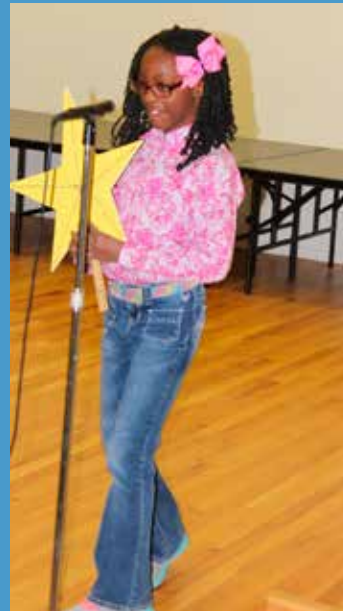
Our children performed for Rotary Club and other community guests in their Holiday Season Musical!