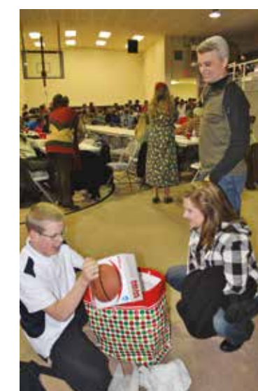
Taylor St Church of Christ in Hobbs NM