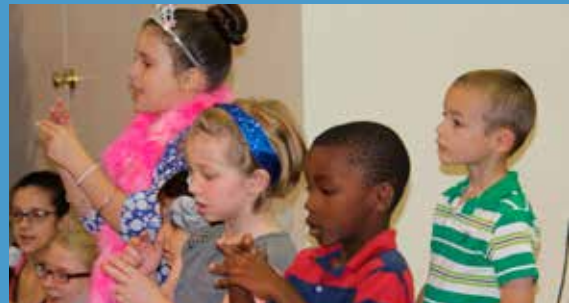
This Christmas season use me, Lord, to give to those in need, a helping hand and gentle words so they see You in me.