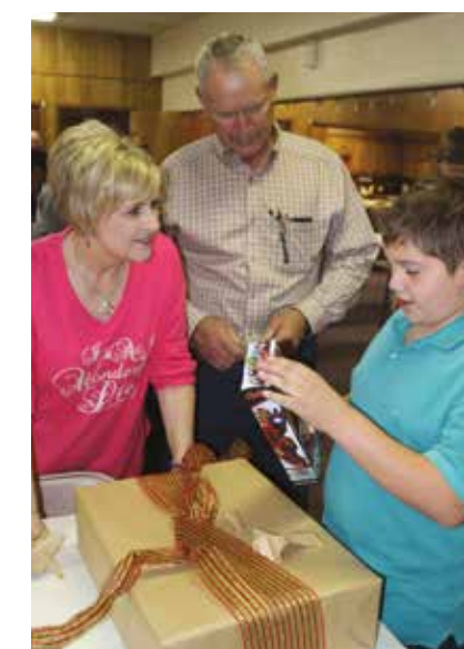
Muleshoe & Lariat Church of Christ