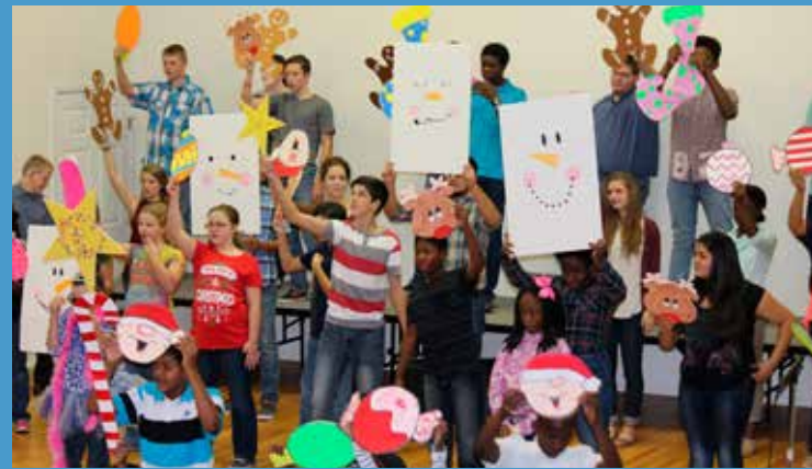
This Christmas, we are going to "Pay it Forward". We want God's Love to flow through us in everything we do!